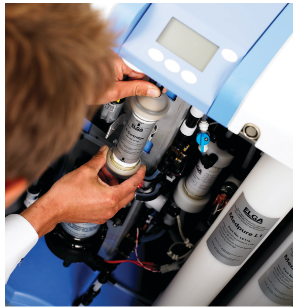
Technology Process Flow MEDICA EDI

The purified water is then passed to a reservoir to provide a quantity of water always available for the analyzer. The purified water from the reservoir is recirculated through a series of technologies, including a UV lamp, ion exchange resin and a sub-micron filter, to ensure optimal water quality is maintained and supplied to the analyzer.